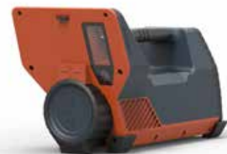
Model SAM 950 Ruggedized Isotope Identifier