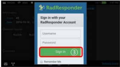
Log In with RadResponder Credentials