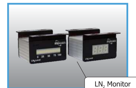
LN 2 Monitor